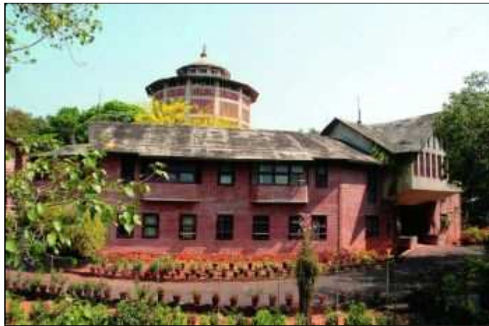
Another view of the CDS. One of the most prominent early building complexes designed by Baker, was a source of inspiration for a generation of architects.

Baker influenced a generation of architectural engineers, who are now trying to further his vision in their own different ways. He taught us the need to relate to our clients; about truthfulness in architecture; the importance of cost-effective, energy-efficient building materials; about cutting corners; and of making truthful choices. He taught us to say no to cement, to the cutting down of trees and to expensive materials. He told us not to squander money, materials or energy; never to design buildings by sitting in isolation at a desk in an office; and to trust and learn from the "inherited ability" of local people to build effectively and well for themselves with limited resources.