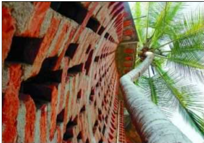
A view of the Centre for Development Studies, Thiruvananthapuram, which Baker designed. He had a deep, genuine concern for nature and trees.

I used to meet Baker at times. But it was still a very distant relationship. I was never really close to Baker then. I decided I needed to study more and chose to go abroad for my masters. Once again Baker became the inspiration. I studied at the very same school where Baker had once been a student (in 1937), the Birmingham School of