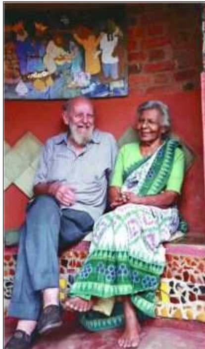
Baker with his wife, Elizabeth, at their home in Thiruvananthapuram.

I was fascinated by the discussion that Baker had with his client that day. It was my first encounter with the man. I had never heard about him before. It was much before I knew anything about architecture or decided to make it my vocation. Several years later, I visited the house that Baker had built for my friend's family. The professor was long gone. The children had all flown away. Their mother, now quite old, was alone in that three-storied house. There were cobwebs in every nook and corner, on the roof and on the spiral staircase. Clearly, nobody climbed upstairs any longer.